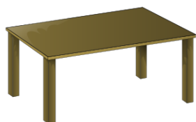
Table Top Sale Sunday 19 March 11am - 4pm